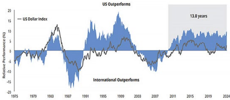
Chart Data: 1/31/75-12/31/24. The chart shows the values of the S&P 500 Index's returns minus the MSCI World ex USA Index's returns. When the line is above 0, domestic stocks outperformed international stocks. When the line is below 0, international stocks outperformed domestic stocks. Data Sources: Morningstar, Bloomberg, and Hartford Funds, 1/25.

As shown in the chart above, U.S. and International markets have historically taken turns outperforming each other with the average outperformance cycle for US versus International stocks lasting approximately 8 years. Given that the current cycle of US outperformance is well above the historical average, a reversion to the mean was likely to occur at some point. We believe that 2 key catalysts have emerged that help to explain the reversal of fortunes that occurred during the first quarter. These catalysts include the policy proposals of Donald Trump and sweeping legislative changes that were recently announced in Germany.